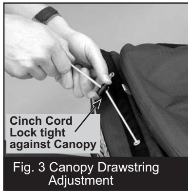
Fig. 3 Canopy Drawstring Adjustment